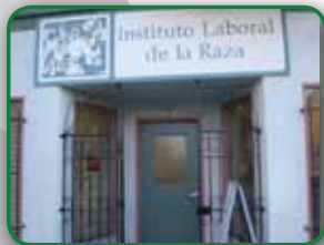
The Instituto 2947 16th Street @ Capp St.

Instituto Laboral De La Raza has a long-term community partner relationship with the Community Thrift, a non-profit thrift store in San Francisco.