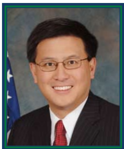
John Chiang California State Controller